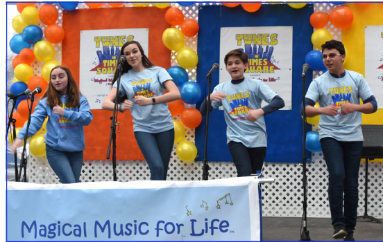
Mary Poppins cast returns to teach the audience the choreography for “Supercalifragilisticexpialidocious”