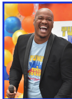
"Genie" from Aladdin