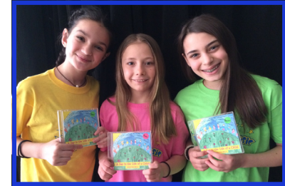
Magical Music Troupe members with our A Day in the Life of a Child album

Magical Music for Life™ , founded in 1999, is a nonprofit charitable organization whose mission is to better the lives of children through the impactful and extraordinary power of music. Toward this end, MMFL has produced a wide range of musical projects with educational, positive, and inspirational messages for children. These projects include: